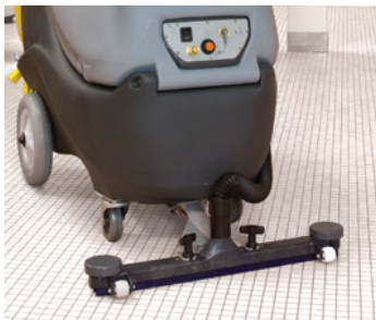
Optional front mount squeegee for easy water pick-up.

Restrooms Locker Rooms Hallways Windows Kitchens Stairwells Carpet Pre-spraying Exercise Facilities