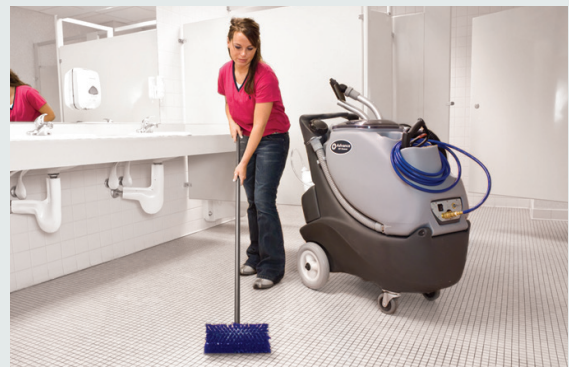
Use the squeegee side to move excess water on floors.