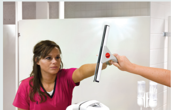
All surfaces are easily cleaned after initial spray down.