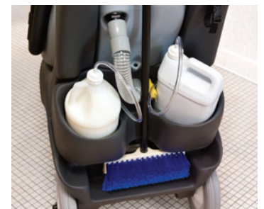
Universal chemical bottle storage.