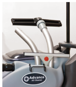
Standard accessories are easily stored on machine.