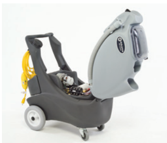
Clam shell design for easy access to the component pallet.