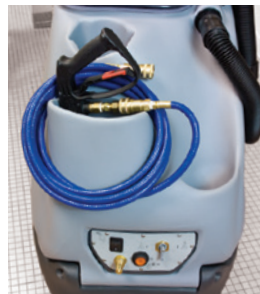
Front storage for pressure washer.