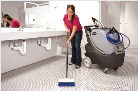
Use the scrub brush to scrub the floor and any other difficult to clean areas.

Advance's All Cleaner XP answers the call for an affordable, touch-less approach to cleaning restrooms and other areas with hard surfaces. You'll improve productivity and see better results – now that's smart cleaning.